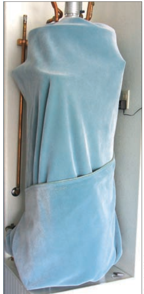
The owners of a home in the Phoenix, Arizona, area heard that you could reduce a gas water heater's energy consumption by wrapping it in a blanket. So they took a blanket off the shelf and wrapped it around the tank.

We should also take a moment to determine if an energy efficiency improvement makes sense in a particular situation. In the Phoenix area, people sometimes turn off their water heater in the summer. They do this because the water entering the home can be quite warm, and because the temperature in the garage, where many of our water heaters are located, can help heat the water in the water heater without using any energy. In the Phoenix area, the money and effort required to install a water heater